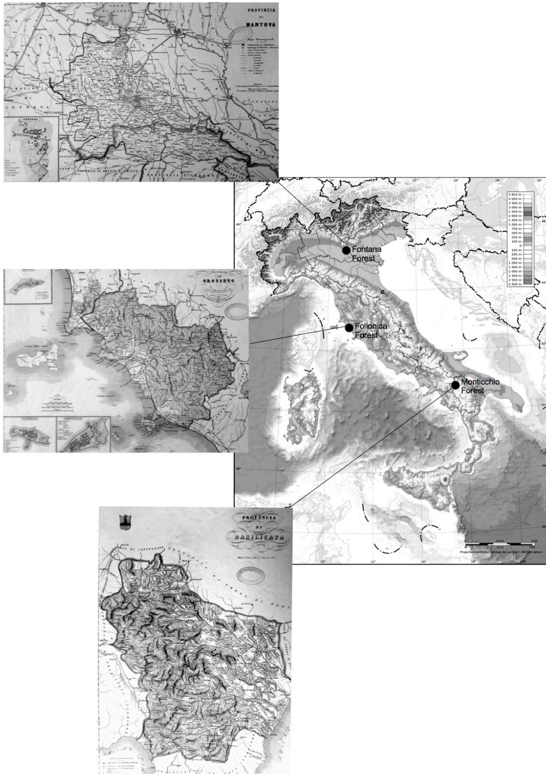
Figure 1: Maps from “L’Italia sotto l’aspetto fisico, storico, letterario, artistico e statistico con speciale riguardo all’industria ed al commercio. Vol. 3 Atlante corografico, orografico, idrografico e storico dell’Italia” - Milano : F. Vallardi, 1883. Biblioteca della Società Geografica Italiana in Roma