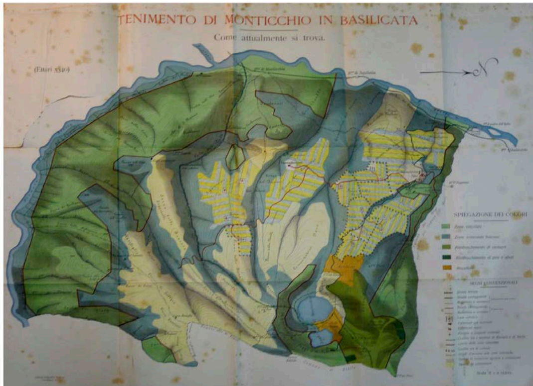
Figure 3: Map of the Monticchio domain showing infrastructure, land use and vegetation in 1900. From Società A. Lanari & C., "La tenuta di Monticchio in Basilicata (ettari 5340). Bonifica e colonizzazione (1802-1900)". Roma: Officina Poligrafica Romana, 1900