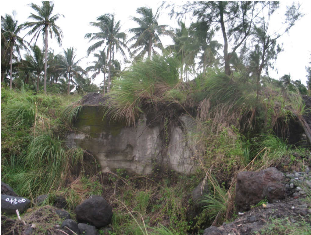
Abandoned Sabo dam on the flanks of Mayon Volcano

ineffective and abandoned (Photo 2) due to the constantly changing nature of the channels down the volcano's flanks and the increased rate of sedimentation. 78